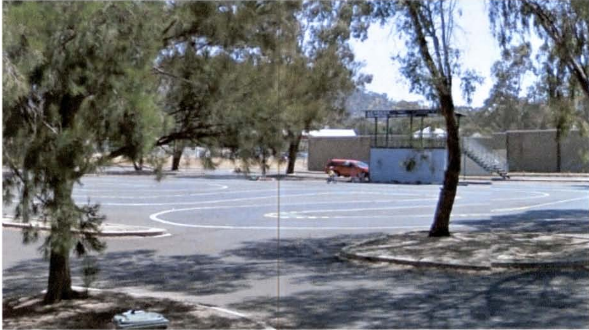
Photo 2: Kambah Jenke Cct facility being utilised by local community

2.4.7 Example of other Australian based facilities can be found at appendix 4.3.