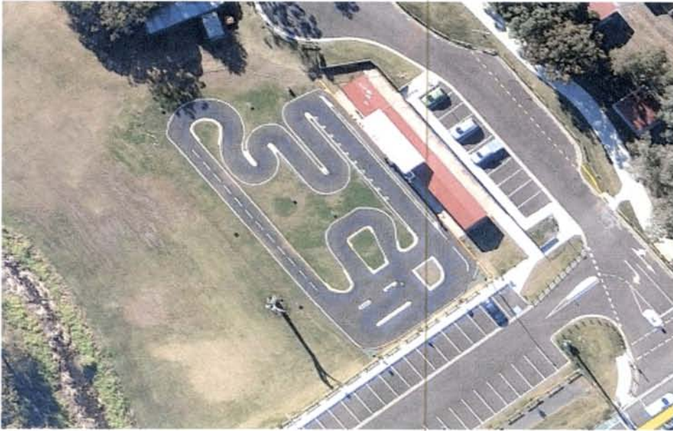
Photo: Wynnum Radio Control – Tangalpa Brisbane