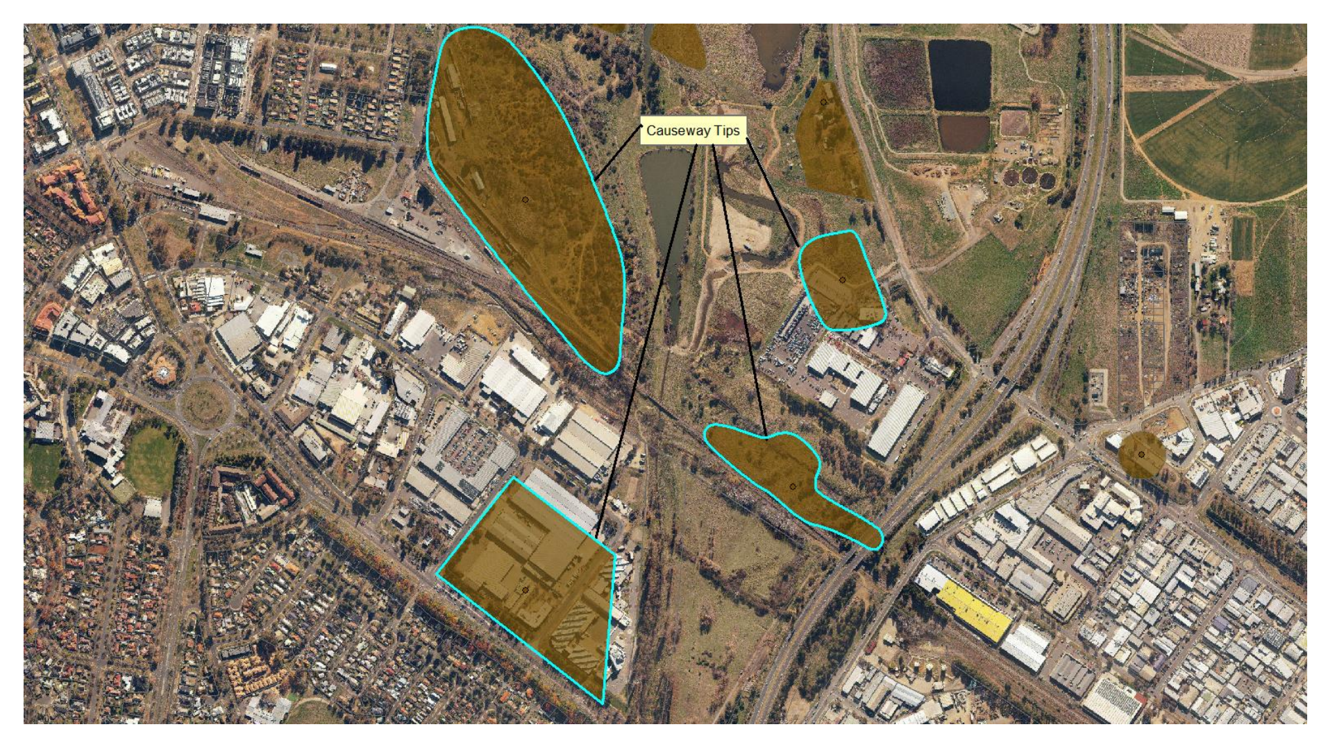
Figure 1 - Environment Protection Authority - Geographic Information System Extract showing location and inferred extent of Causeway Tips based on Waste Management Section data