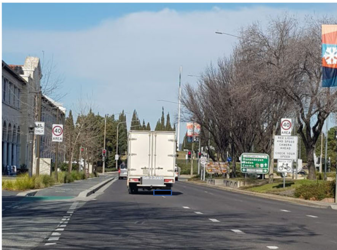
On approach to Camera location Northbourne Ave/ London Circuit. 40 km signs and Speed Camera Ahead signage.