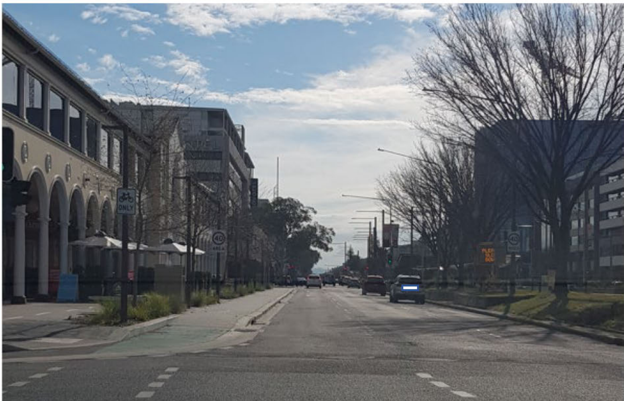
40 km/h zone signs just after London Circuit