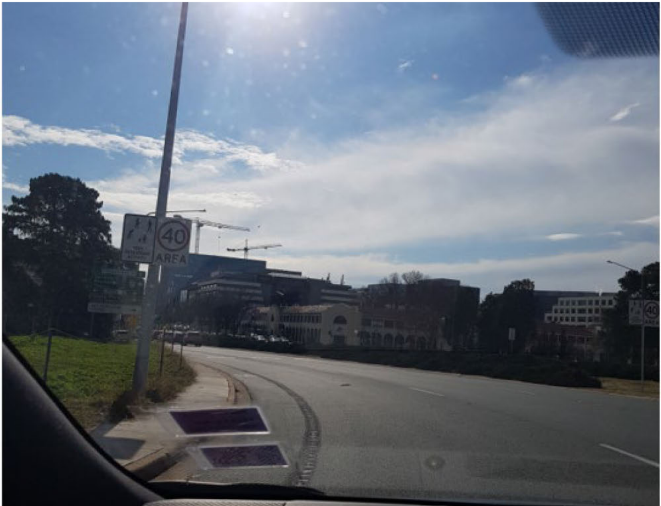
40 km zone starts at Vernon Circuit approaching the City Northbound 500 metres before Camera located at Northbourne Ave/ Barry Drive (1002)