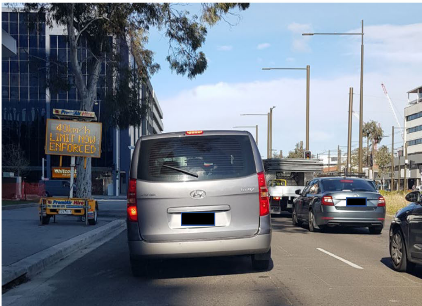
VMA signs erected to advise of speed limit changes – Northbourne Avenue