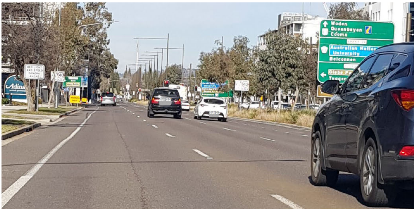
Image Taken on Northbourne AVE before Cooyong Street 40 km zone and Speed Camera ahead signs.