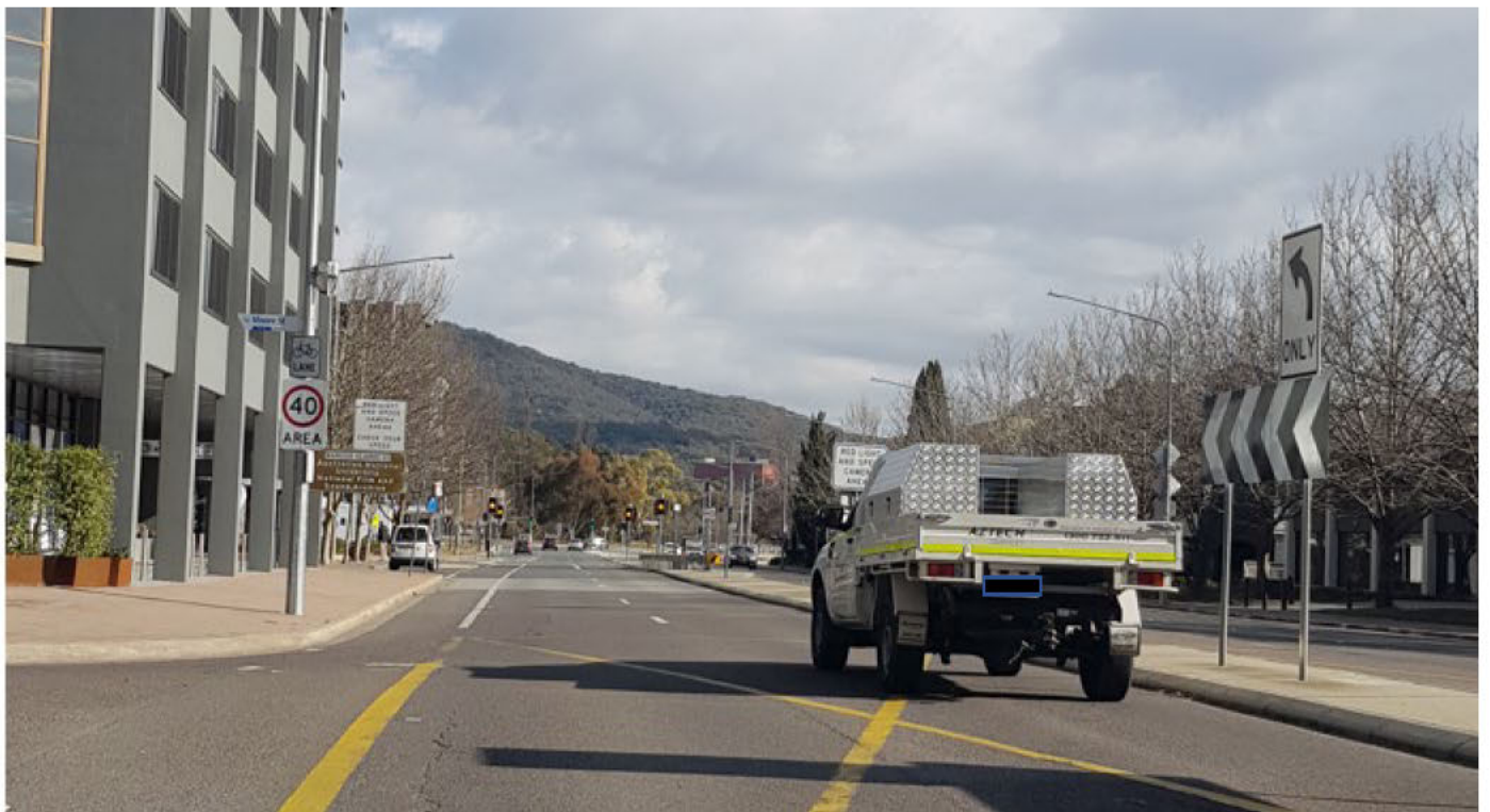
Proceeding on Barry Drive (westbound) 40 km speed limit signs and Speed camera ahead signs on approach to the camera location (Intersection of Barry Drive and Marcus Clarke Street)