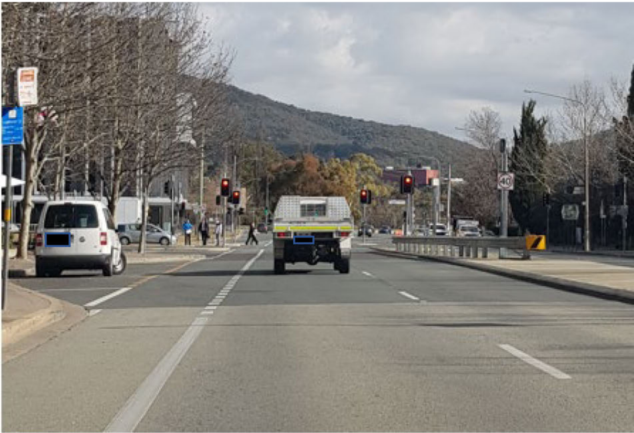
40 km/h speed sign located at camera location at the intersection on Barry Drive and Marcus Clarke Street