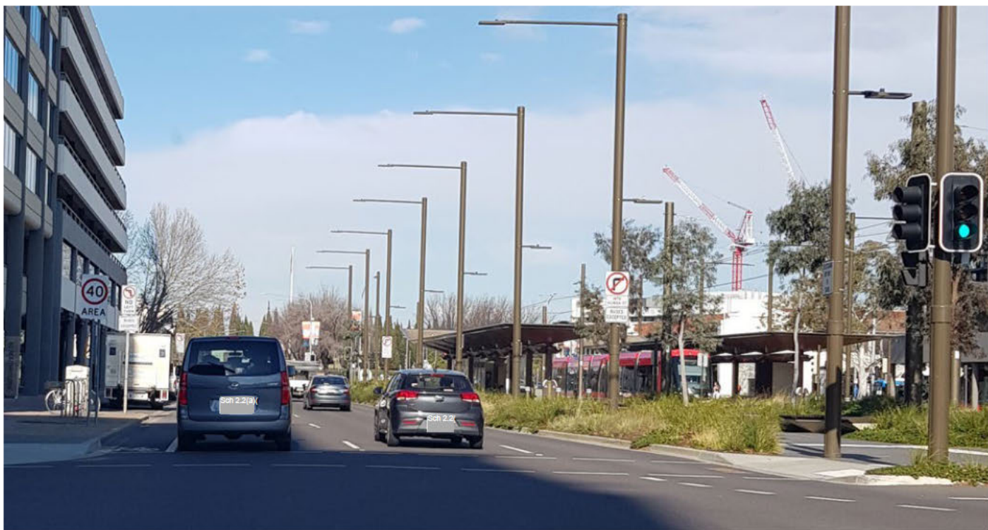
Northbourne Ave on approach to camera location Northbourne Ave/ London Circuit.