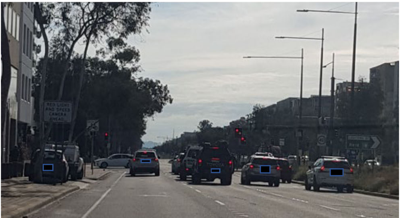
Image taken at the camera location Northbourne Ave/ Barry Drive – Another 40 km/h speed limit sign.