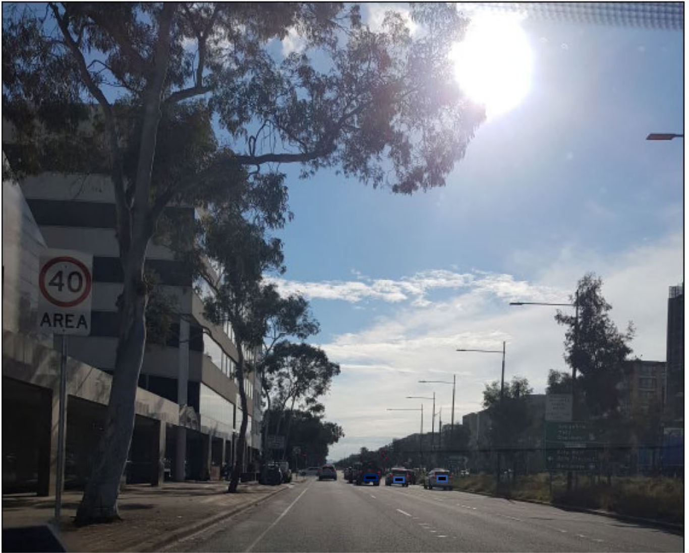
40 km speed sign and Speed Camera ahead sign located on Northbourne Ave approaching Camera location (Northbourne Ave/ Barry Drive)