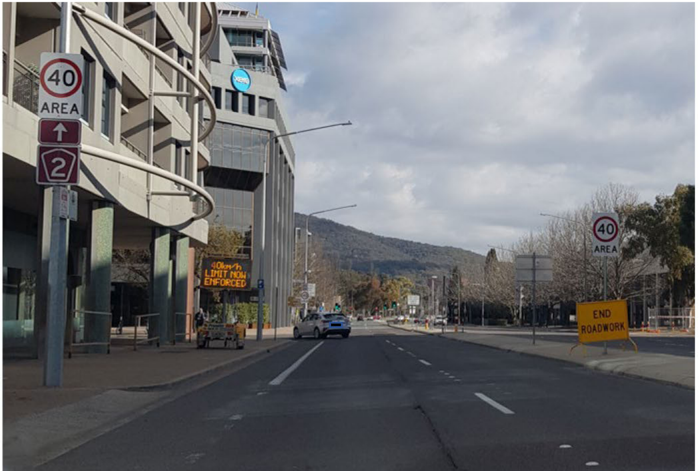
Entering Barry Drive from Northbourne Ave, 40 km zone signs